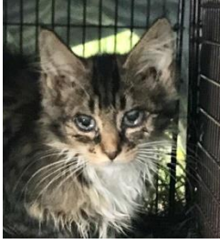
Donnie, when captured

Last summer, a Munfordville resident reported feral kittens living in a culvert and the TNR team was able to trap the two beauties. Sadly, the kittens were too sick to be spayed and neutered right away, so “Donnie and Marie” were given several rounds of antibiotics. During the weeks of convalescence, the pair became friendly and were accepted into our foster program.