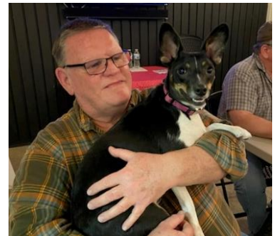
Trixie and her new owner