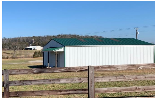
Doc McFarlin Building – Future Shelter

This is a major step forward for our county, for animal welfare, and for our local citizens. Stay tuned for more information as we all work together to help achieve the July 1 startup date for the new Hart County Holding Facility. Message from ARK's Board of Directors