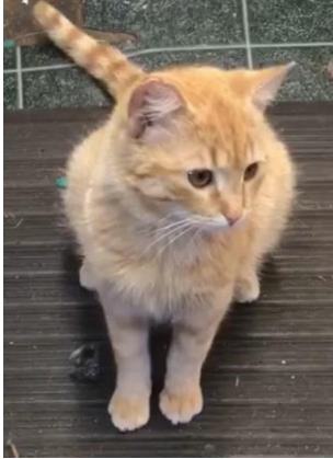
Can you adopt Blossom?