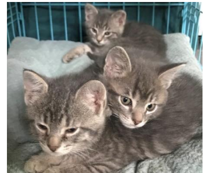
Even though they are adorable, it is hard to find homes for every kitten.