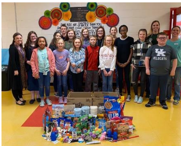
Student Council at Legrande, with over 100 items for the foster program