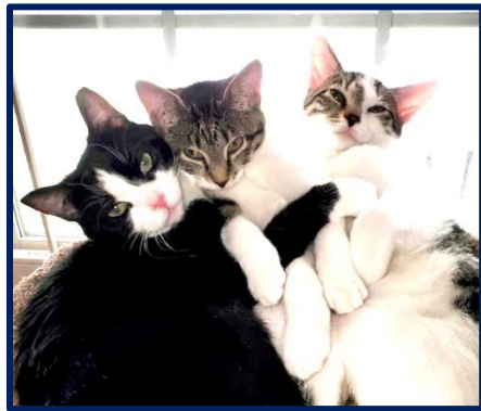
Figaro, Rey, and Kylo relaxing in their loving home