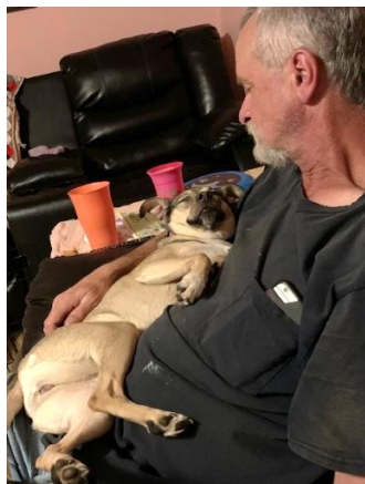
Rosebud, showing just how spoiled she is!

Rosebud was a puppy in December 2018 when her owners decided to get a divorce. They surrendered both her and her "brother" Fudge for rehoming. Rosebud, a brown min-pin mix, didn't know how to control her high energy, much less anything else. She was bouncing off the walls with energy. She loved going on car rides, walks, playing with other dogs, etc. At our foster home, she was house-broken and partially leash-trained before she was adopted by a loving family.