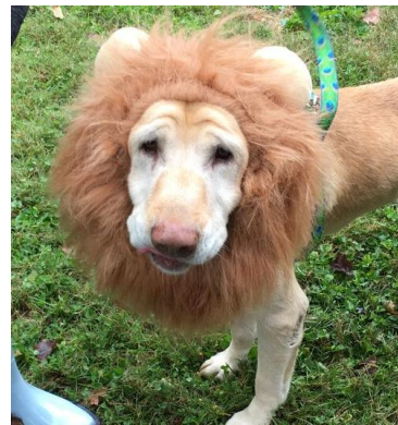
Buddy, one of our foster dogs, looking good last year

Get your costume ready, get your pet's costume ready, bring your friends – furry and not so furry - and join ARK for this afternoon of ghoulish fun.