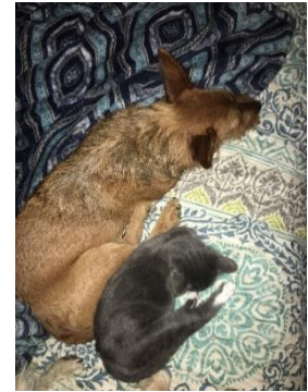
BFFs relaxing together

Mushu has a heart of gold and was the first to welcome a foster kitty named Stella, who was very small at only two pounds. She was a beautiful and majestic blue tuxedo, who was tiny and scared until the red dragon curled up with her. She took comfort in his easy way of loving, and as she began to grow, she opened up to all in our family. Going from not wanting to come out from under the bed, to not leaving the bedroom, to exploring and owning the entire house. Often rolling and playing and roughhousing with her faithful dragon.