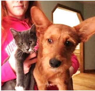
Mushu and Esmerelda

A bit ago, we began to foster for ARK. We are animal lovers and already have many pets, but we felt called to open our home to furbabies in need of a soft place to land. Mushu (as we have named him for the little red dragon in Mulan) was our third foster pup. He appears to be a Corgi mix and has the ears to show for it. 😊 He was just so sweet, loving, and calm that we decided to make him a permanent member of our family.