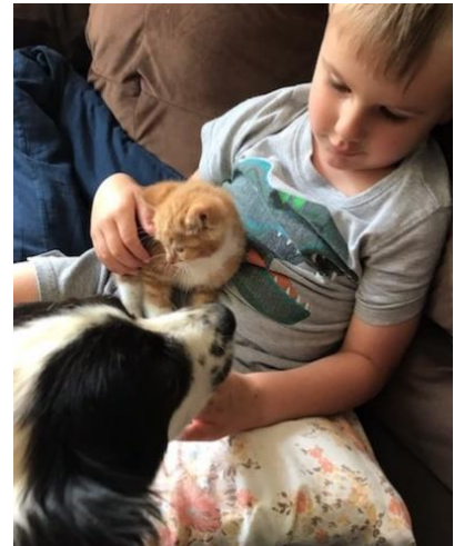
TNR kitten, Ginger, in her new home.

We also want to thank Two Mauds, Inc. for the TNR grant. ARK plans to seek for funds to continue this important program. Many strays are still in need. If you know of any stray cat colonies, go to our website and fill out the form on the home page: www.ark4hart.org . We will try to help them all.