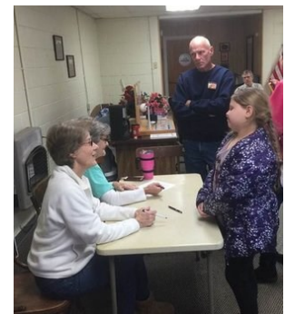
Distributing low-cost vouchers to reduce the number of unwanted animals.

Last year, voucher distributions took place in Munfordville, Hardyville, Cub Run, Bonnieville, and Horse Cave. Events for this year will soon be announced. Stay tuned!