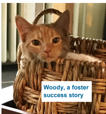
Woody, a foster success story